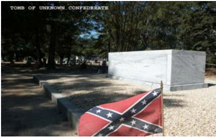
Tomb of the Unknown Confederate